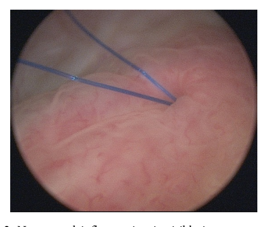
Figure 2: No ureteral inflammation is visible in contact with the suture thread.